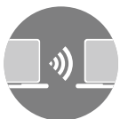
Virtual office solutions Registered address & voicemail