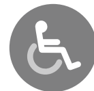
Disabled facilities Incl. toilet, lift, shower & hearing loops