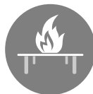
6 x Hot Desks Available for daily hire