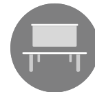
14 x Meeting rooms Capacity 8