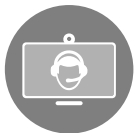
Video conferencing facilities