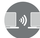
Virtual office solutions Registered address & voicemail