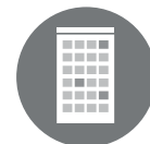
Nearby Hotels Within the local area