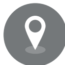
Central Hounslow location Based in the Treaty Centre shopping centre; Hounslow Central (Piccadilly Line) tube station less than 10 mins walk