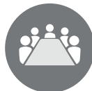
Boardroom Capacity 8