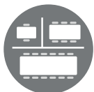
Meeting room hire Available any time